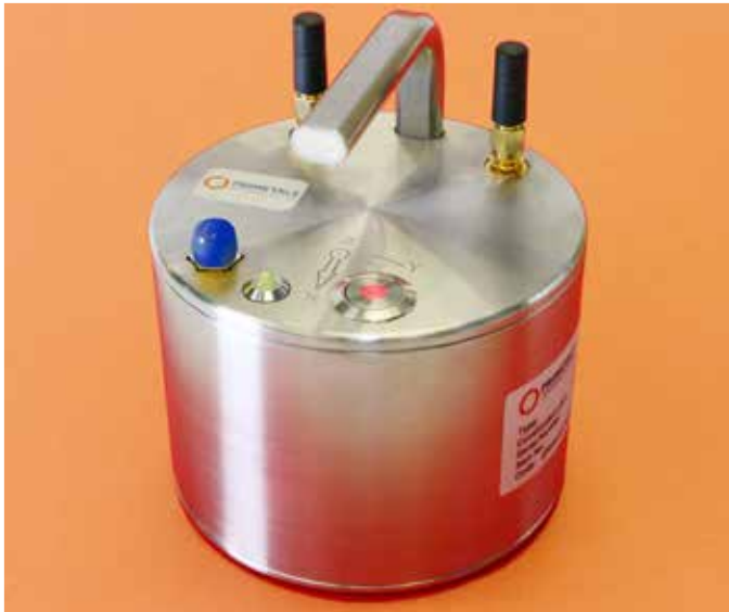
OsciChecker Wireless Sensor