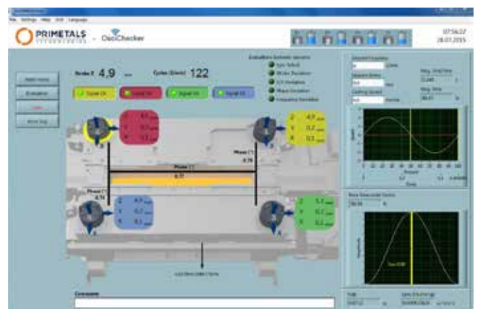
Evaluation screen OsciChecker Wireless