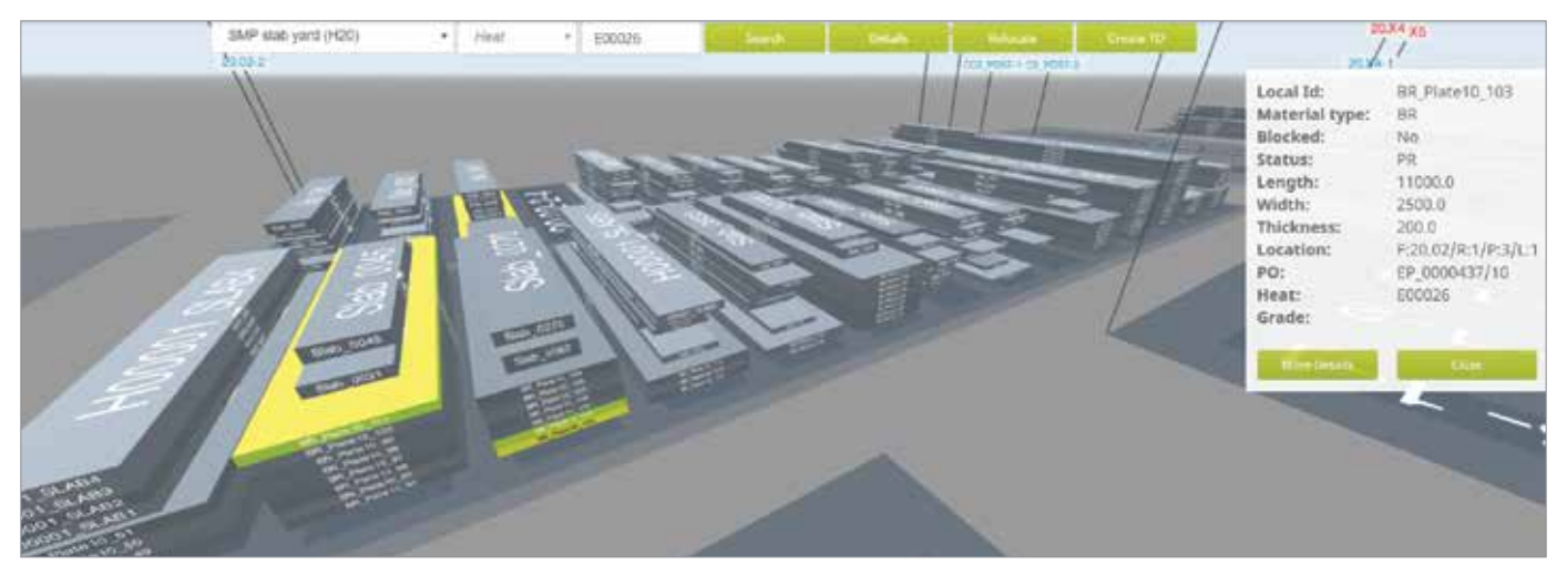
Primetals Technologies' Yard Management Solution offers 100% material location tracking and material identification.