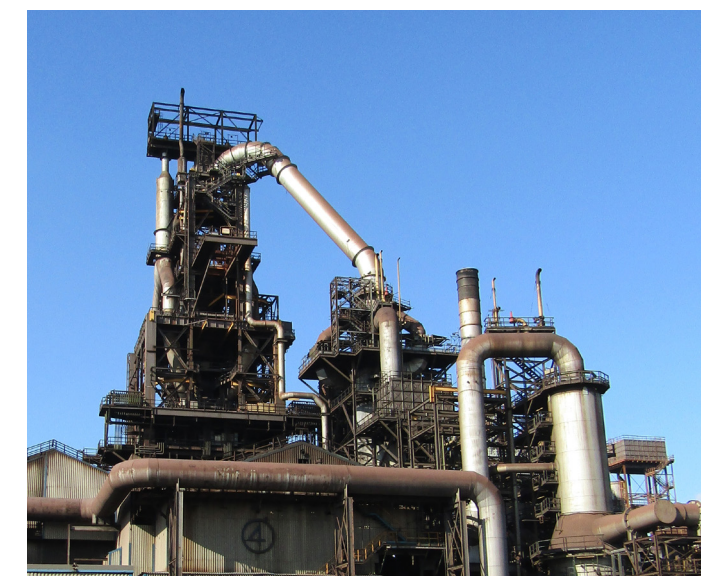
Tri-Ax Cyclone and modified downcomer