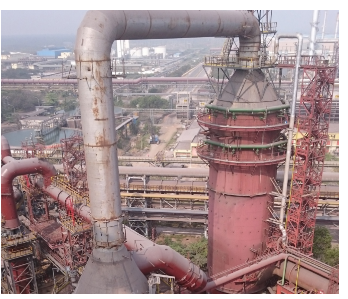
New Davy Cone Scrubber installed inline with existing spray tower