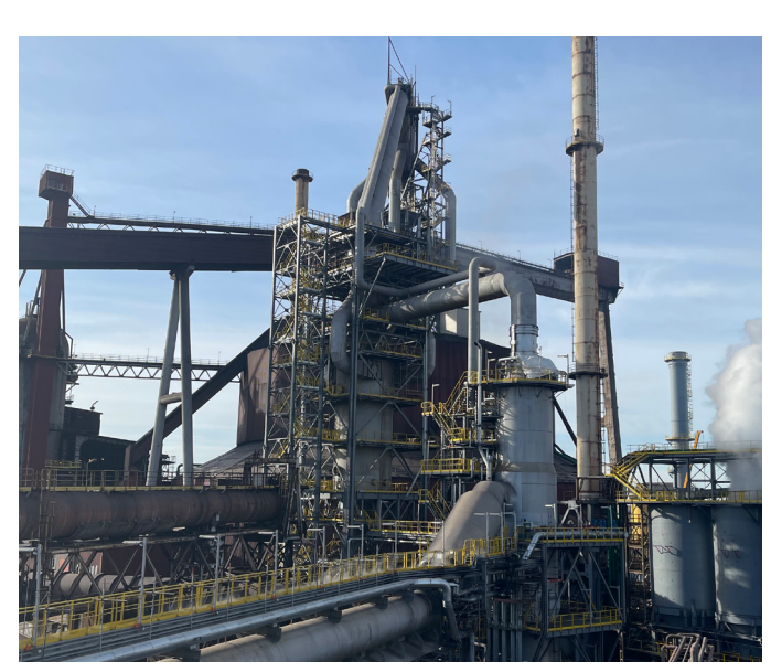
New off-gas system and gas cleaning plant