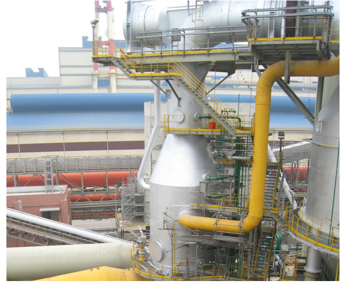
Gas cleaning plant at Dragon Steel BF 1